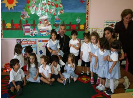
Prelate's visit to our school